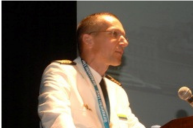
CAPT Jonas Haggren, Commander 1 st Flotilla, Royal Swedish Navy, Sweden;