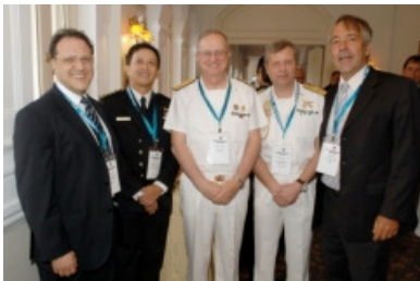
Key Industry leaders were also at the two day Conference. This included Managing Directors, worldwide Sales and Marketing Vice-Presidents, and Directors from:- Eurotorp, DCNS, Finmeccanica, Kokums AB, L3, MTU, SAGEM, SELEX SYSTEMI INTEGRATI, ST Electronics, THALES, ULTRA and WASS.

The keynote speakers discussed the operational and technological developments in their respective countries. Their speeches were based on their appreciation of strategic and operational situations and threats, with a focus on specific projects and programmes in their individual organisations. The role of technology and its strategic usage in these organisations was very clearly emphasized by the distinguished speakers.