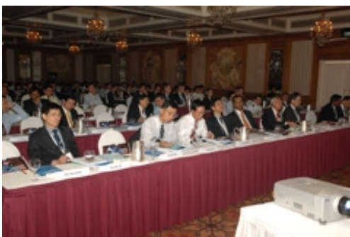
Delegates at the Satellite Technology Asia 2008 International Conference

The event brought together - from all over the world - decision makers, operation managers, end users, technologists and procurement specialists in the industry.